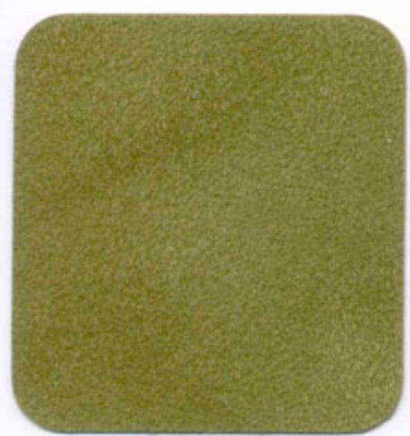
Moss Green DS953