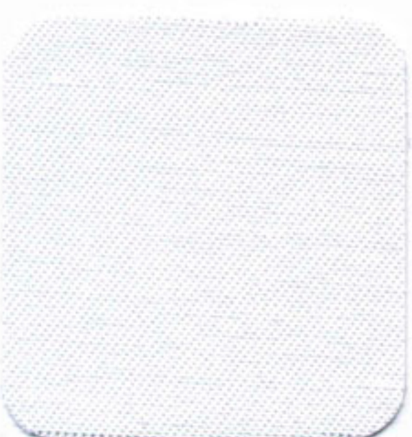
Shiro ☀️ DF940