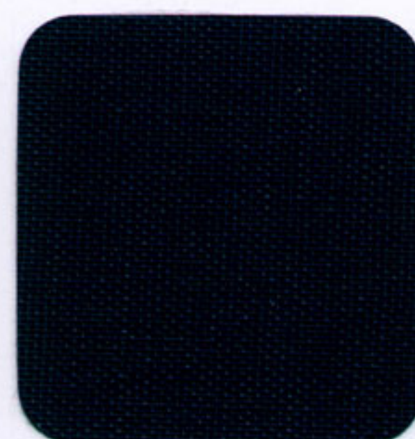
Dynasty Blue DF924