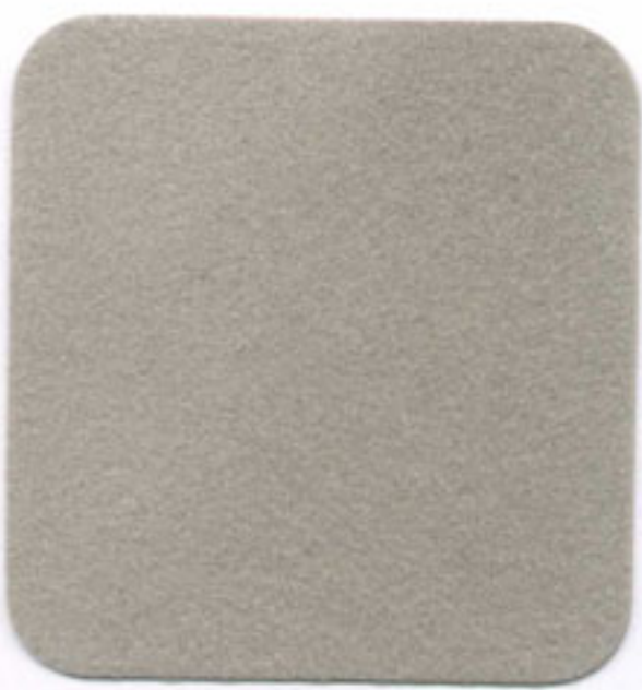
Dove Grey DS965