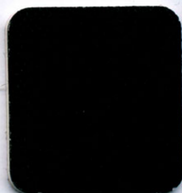
Black Shadow DF935