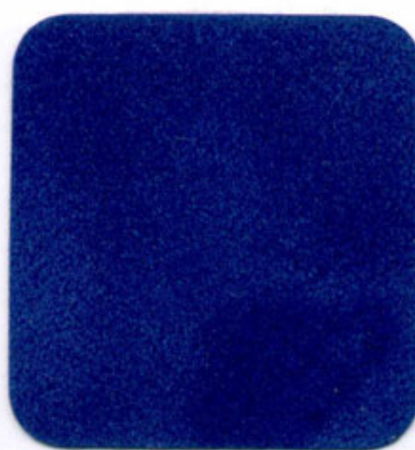
Royal Blue DS962