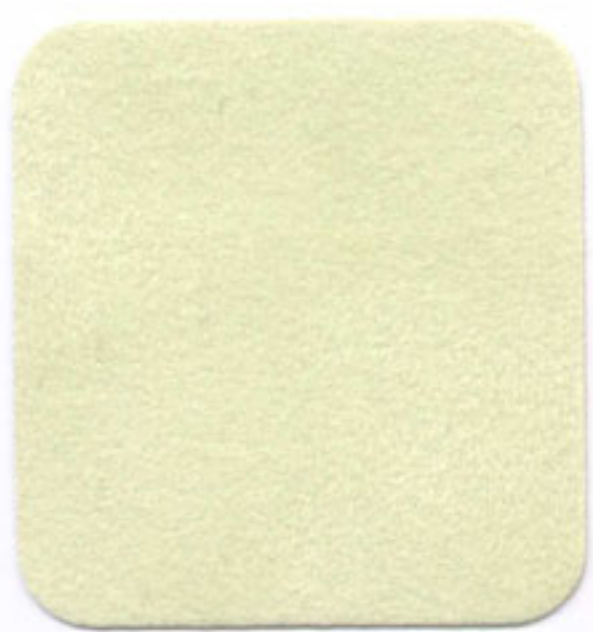
Mint Green DS966