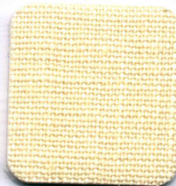
Real Cream DF932