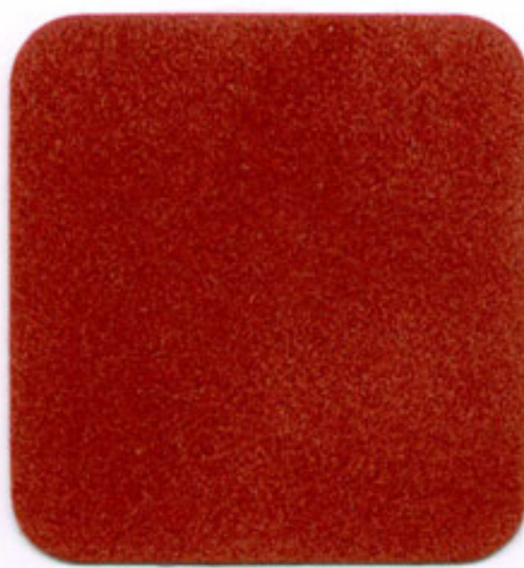
Red Rock DS976