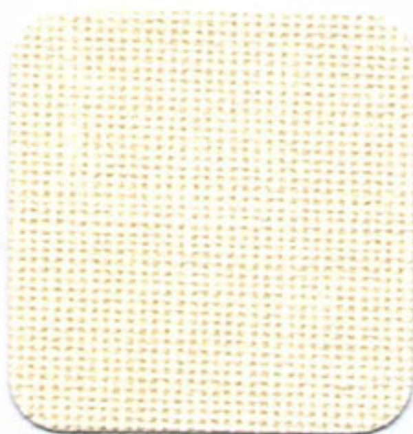
Gallery + DF921 DFG6921