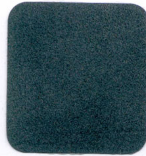
Gun Metal DS961