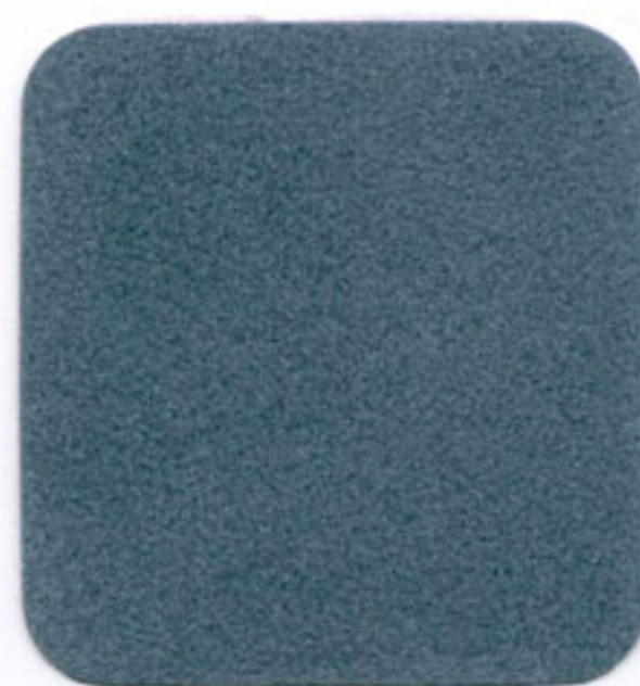
Slate Blue DS968