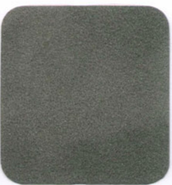
Gull Grey DS969