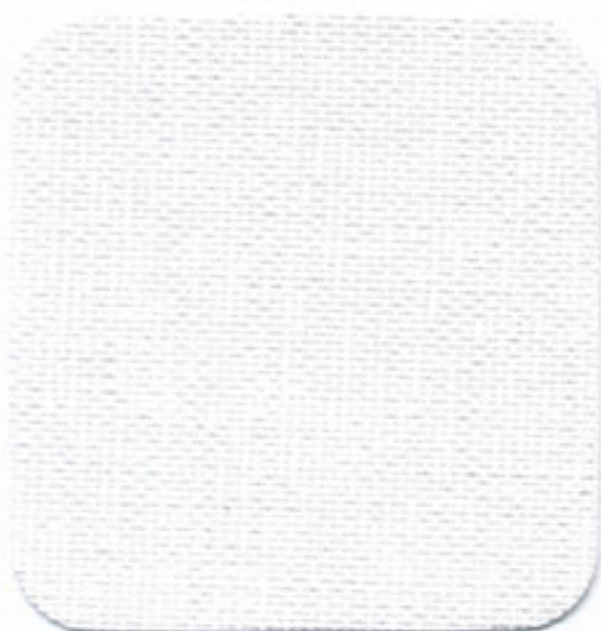
Brilliant White ☀️ DF925