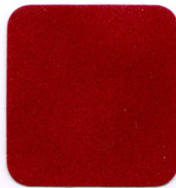
Royal Red DS957